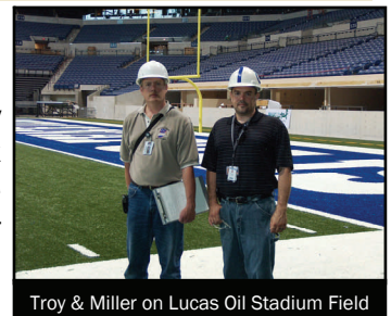
Troy & Miller on Lucas Oil Stadium Field

annually to check the sprinkler systems, boilers, alarms systems, building evacuation plan and exit signs.