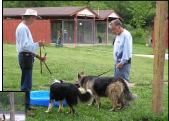
The act of lapping water together after a workout reminds the dog of being puppies together in the litter.