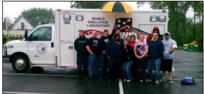
St. Mary’s Medical Center graduating paramedic class received hands on experience with the Mobile Simulation Laboratory

For more information, or to find out how to bring the MSL to your area, visit http://www.in.gov/dhs/3727.htm .