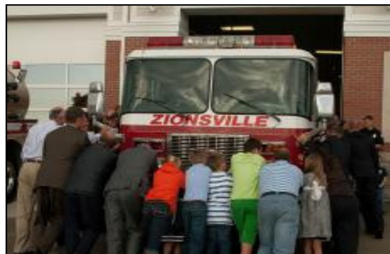
As part of the dedication ceremony, the community helps push the fire engine back into the facility.

Zionsville Fire Station 93 was a project that the town of Zionsville had been planning for more than ten years. The fire station is completely funded through tax dollars saved over the years, and no money was borrowed nor financed.