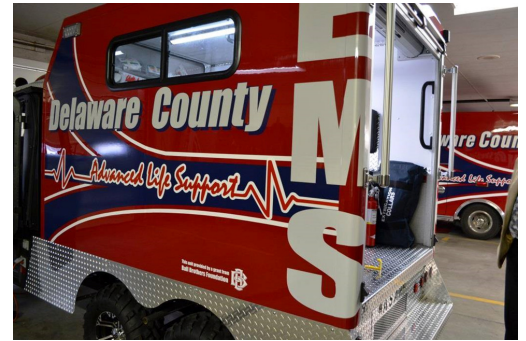
The new EMS vehicle was purchased with a grant from the Ball Brothers Foundation. The foundation supports culture, education, healing and projects benefiting the public.

football games as it could in making life-saving runs on the Cardinal Greenway or on trails at Prairie Creek Reservoir. As one of very few such units in Indiana, the medical ATV sets Muncie-Delaware County apart. The addition of this unit allows other ambulances to stay on-duty and certainly piques public interest, making it a great centerpiece for public education efforts.