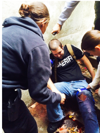
Law enforcement officers practice techniques for stopping blood loss and stabilizing patients.